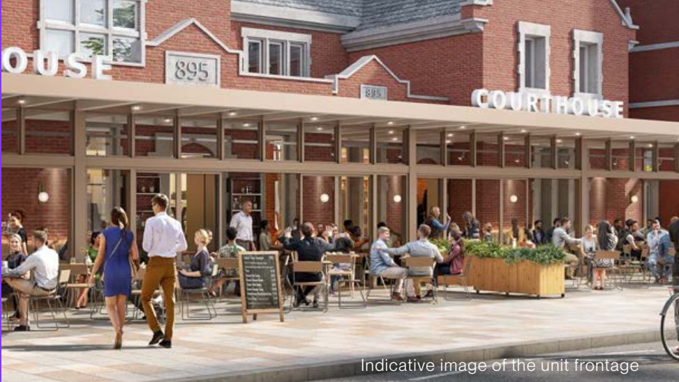
Indicative image of the unit frontage